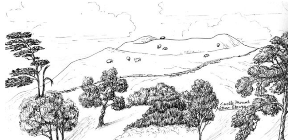
Castle Mount, Nether Stowey