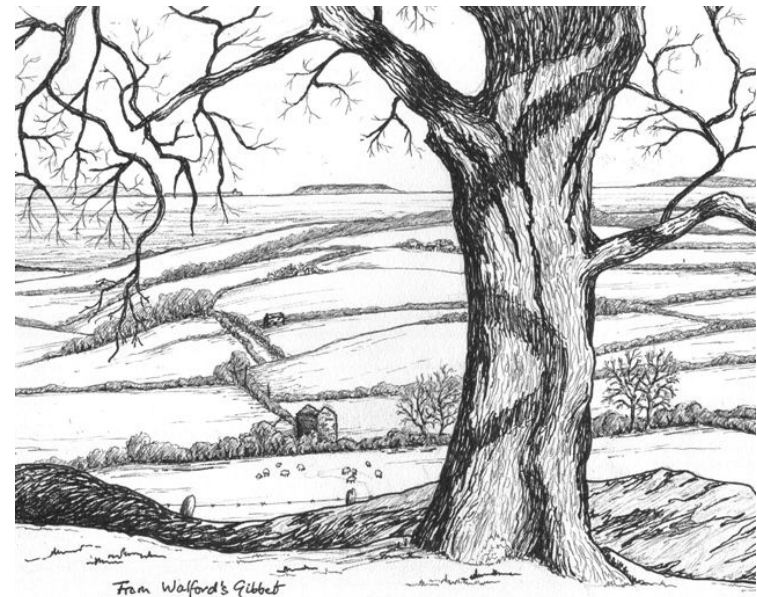
View from Walford's Gibbet

The Nether Stowey Parish Footpath Group thanks The Ramblers' Association (Sedgemoor Group) for their assistance with the funding of this project.